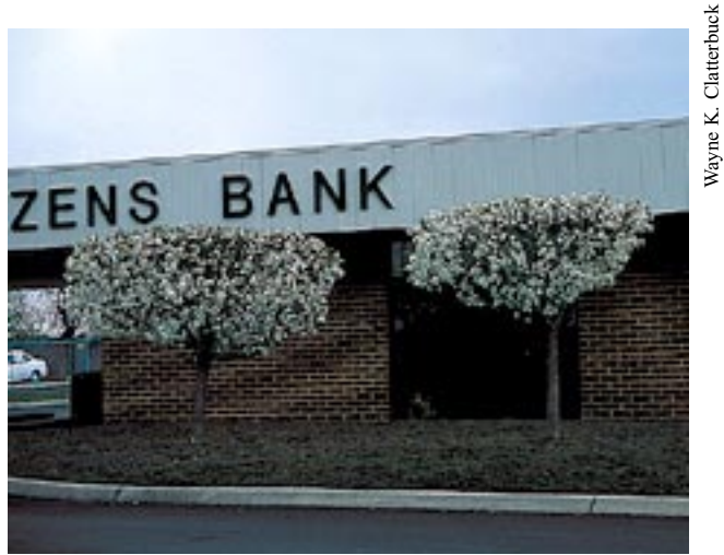
A "topped" flowering pear.

The practice of topping is so widespread that many people believe it is the proper way to prune trees. However, topping causes a variety of problems in trees that create future maintenance and growth dilemmas for homeowners.