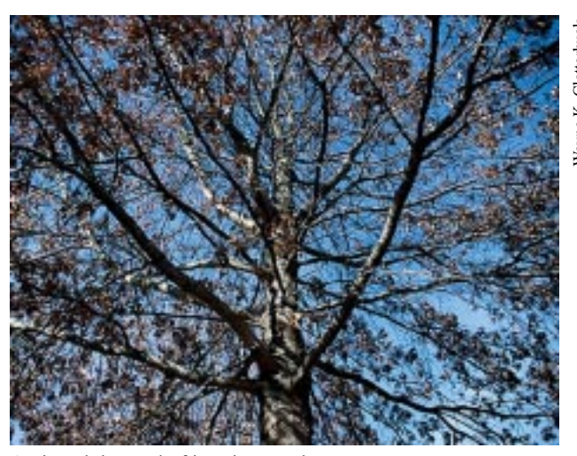
A pin oak in need of interior pruning.