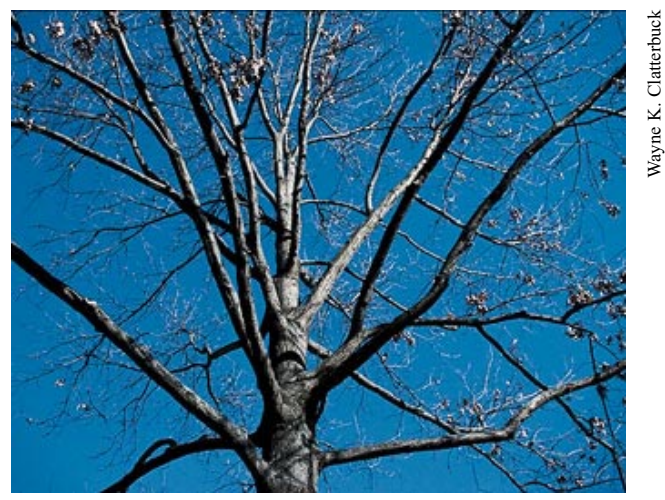
Proper pruning and crown thinning of interior branches on pin