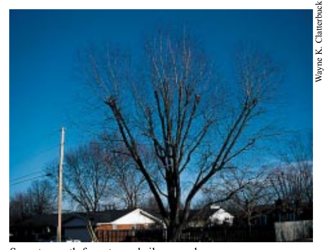
Sprout growth from topped silver maple.