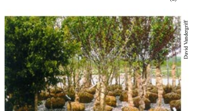
Examples of (a) bare-root, (b) balled and burlapped, and (c) above ground pot-in-pot nursery production systems.

planting process, primarily from adverse changes in their ability to absorb water due to root loss. Water stress is the primary cause of transplant failure. Root loss affects hormone synthesis and distribution that regulate shoot growth. Root loss also reduces carbohydrate storage, affecting energy available for rapid root regeneration, critical for transplant survival. The ability of a tree to maintain sufficient vigor while recovering from the adversities of transplanting will determine its success or failure. Trees have traditionally been offered for sale in the nursery trade using three methods: bare-root, balled and burlapped (B&B), and containers including pot-in-pot and