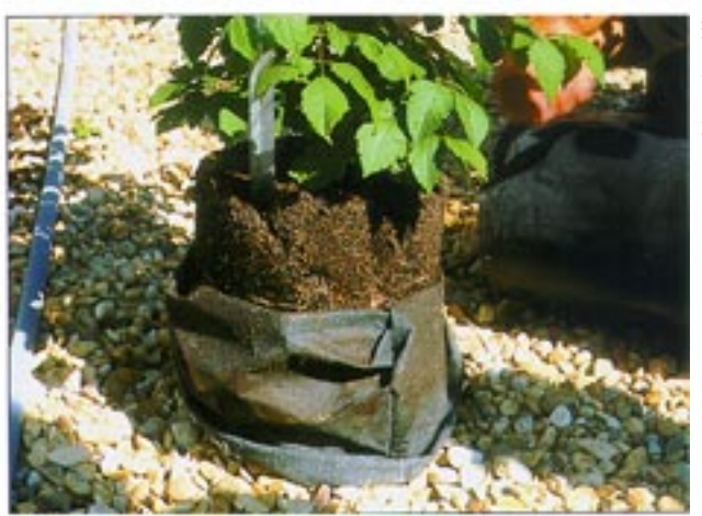
Fabric container grow bag.