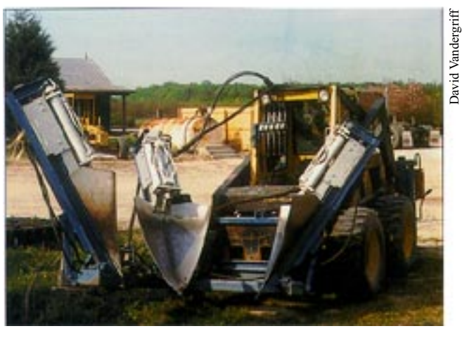
Mechanical tree spade.