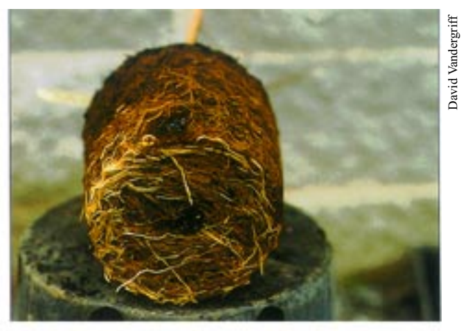
Circling roots are common in containerized plants. Roots should be cut in a few places to initiate new roots and prevent circling roots from eventually girdling the tree trunk.