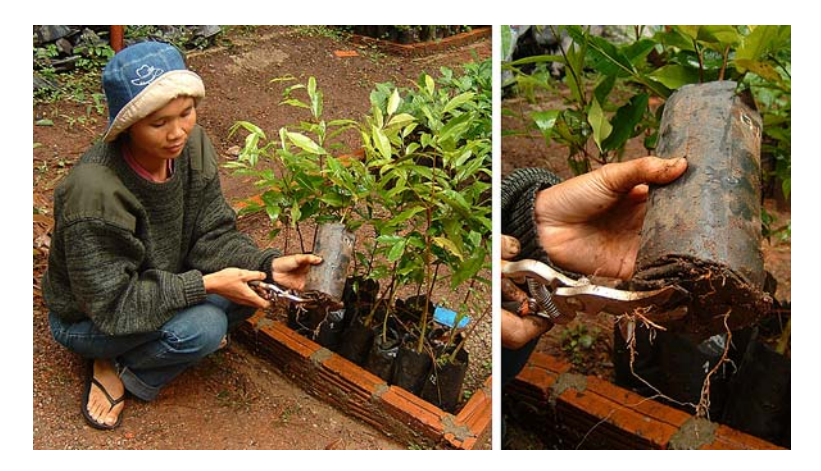
Fig. 3 Root pruning of saplings in tall polybags

Experiments have confirmed that forest soil is a critical ingredient of the potting mix because it contains mycorrhizal fungi and possibly other microbes that are necessary to promote seedling growth (Nandakwang et al. 2008). Research showed that the most suitable mix is 50% forest soil, 25% peanut husks and 25% coconut husk. Charcoalized rice husk can also be used, but present a health hazard, such that nursery workers need to wear a mask when dealing with this ingredient.