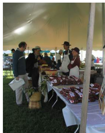
Top: Curly willow can be a profitable crop when sold to local florists (Nebraska Woody Florals Cooperative). Left: Chestnuts sold at the Missouri Chestnut Roast Festival