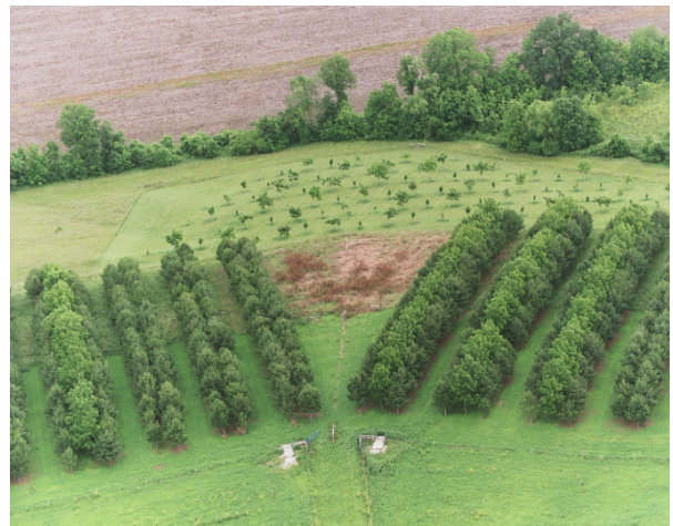
An aerial view of the Horticulture and Agroforestry Research Center shows a silvopasture research area pattern. Double rows of tree plantings are shown on the left; triple rows are on the right. Multiple rows provide large volumes of wood without overly sacrificing forage production.

Differences exist between the results that can be expected from each tree arrangement. Landowner objectives will determine the best