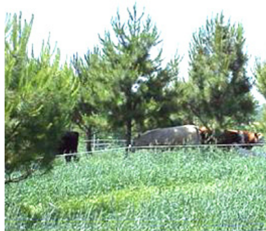
A single row of pine and fencing allows for managed paddock grazing based on forage response to grazing.

Finally, crown management through pruning may be beneficial if the desired tree product is nuts. An open crown not only allows more light to reach interior branch tips (necessary for flowering and fruiting), but also will allow increased light to filter through to the forage.