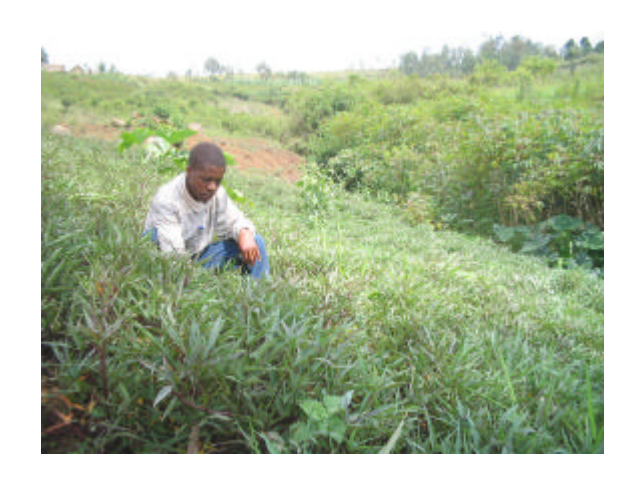
Sweet potato project for food security