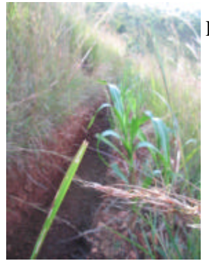
Prevention of soil erosion and stop water flows on hills