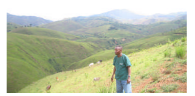
Coordinator, Agronome and pepiniersits all dealing towards success