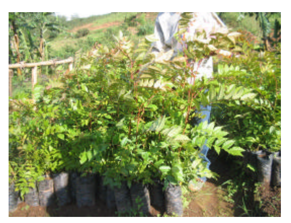
The ancient forest type of Burhinyi: Albizia forest