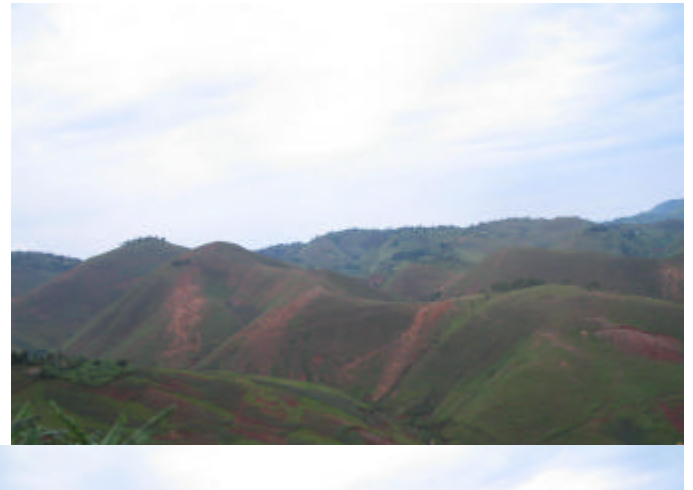
To reforest Burhinyi: a big challenge