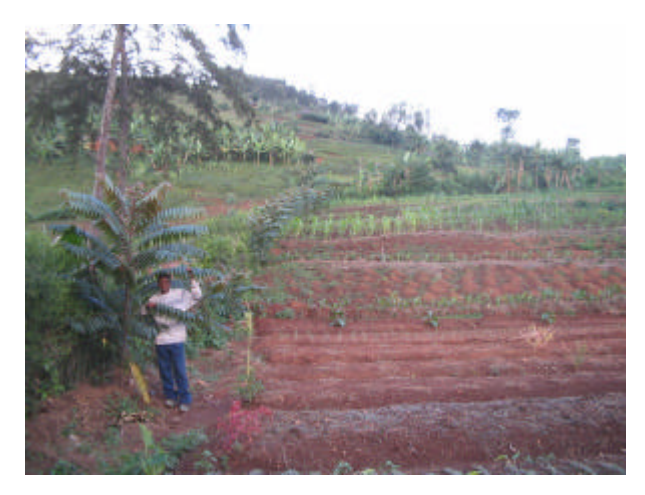
CODIMIR Project on poor soil to be improved