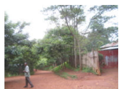
Reforestation initiatives in Mulambi