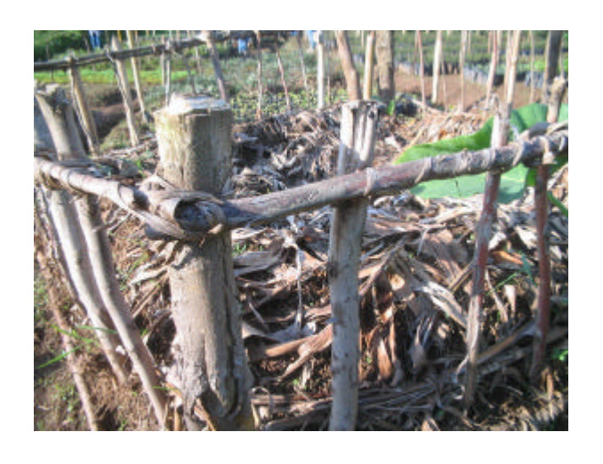
Compost techniques for soil improvement