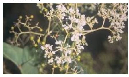
Harungana madagascariensis flowers