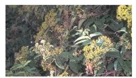
Harungana madagascariensis foliage (Joris de Wolf, Patrick Van Damme, Diego Van Meersschaut)

In southern Africa, flowering can be observed from January to April followed by fruiting until October. In Sierra Leone, flowering begins sparingly in May, reaches its height in August and September and then tapers off up to about December; flowering is always very profuse. Fruits of the usually evergreen tree ripen from September up to January.