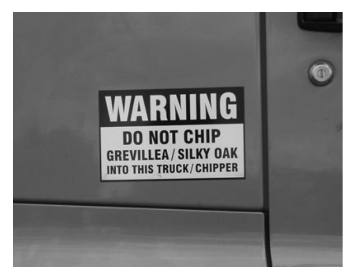
Figure 3 Warning sign against Grevillea robusta on truck of an arborist company.

The distribution of the dermatitis is also of interest. Typically the dermatitis following exposure to a plant is confined to the areas that have been in direct contact with the plant only. Sawdust is, however, easily transferred to sites, in particular the trunk, axillae and genitalia (as described here), which have not been directly exposed to plant parts.