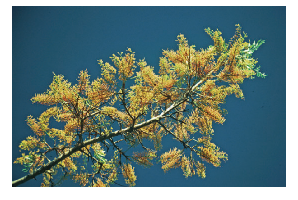
Figure 2 Inflorescences of Grevillea robusta.

the face and eyelids with vesicles and bullae on the neck and limbs. In addition he developed vesicles in the axillae, back of the knees, waistline, and groin, which are characteristic of sawdust dermatitis. On this occasion the dermatitis persisted for more than 2 weeks. Patch tests to G. robusta were performed by applying a 1-cm sliver of wood, as well as 1-cm^2 pieces of leaf (upper and lower surfaces), to the forearm, covered with skin tape, for 48 h. At 48 h the readings were negative, but at 96 h, he had a 1+ reaction to the sample of G. robusta wood.