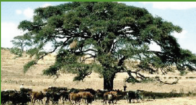
Livestock producers value Faidherbia for its high quality leaf and pod forage during the most severe drought periods.

Millions of farmers grow sorghum or millets in association with Faidherbia trees in Niger, Nigeria, Burkina Faso, Mali, Senegal and several other countries in the Sahel. Accelerating farmer-managed natural regeneration with Faidherbia forests on crop lands is re-greening major parts of the Sahel.