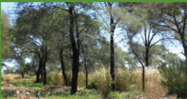
Farmers throughout Malawi sustain Faidherbia agroforests in their maize fields. (Malawi, 2009).

Some 500,000 farmers in Malawi, Tanzania, and Zambia cultivate their crops in Faidherbia agroforests and report that their maize yields are doubled or tripled.