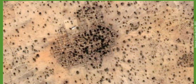
Faidherbia -dominated farmlands in Niger with up to 150 trees per hectare. Trees are black dots on the image, with a farming village in the centre. Farmer-managed natural regeneration of Faidherbia -dominated agroforests in the sorghum-millet growing zones of Niger cover more than 5 million hectares. Zinder, Niger.

One goal of agroforestry science is to refine, adapt and extend Faidherbia systems to tens of millions more farmers and to pastoral communities throughout the African continent.