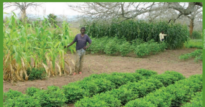
Crop yields under the canopy of Faidherbia are often observed to be double or triple those outside the canopy of the tree (Zambia, 2009).

Millions of farmers grow sorghum or millets in association with Faidherbia trees in Niger, Nigeria, Burkina Faso, Mali, Senegal and several other countries in the Sahel. Accelerating farmer-managed natural regeneration with Faidherbia forests on crop lands is re-greening major parts of the Sahel.