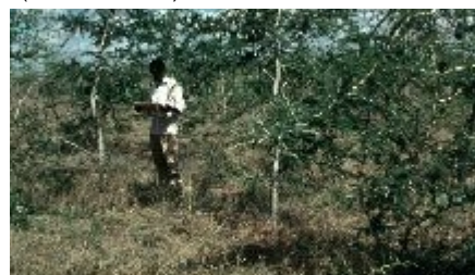
Provenance trial in Zimbabwe