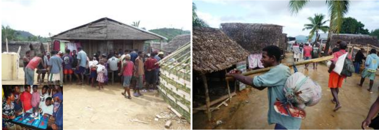
Photos 17, 18 “Casinos” and forest workers in the village of Antanandavaheli

Antanandavaheli has subsequently seen an influx of more than 800 people. A number of itinerant merchants have settled temporarily in the village; small temporary restaurants are run by businesspeople from Antalaha, and at least three “casinos” are frequented by the village youth from morning to late evening. At the onset of logging activities, an understanding of the risk of sexually transmitted diseases through the introduction of prostitution inspired the local HIV/AIDS association to carry out an awareness raising campaign.