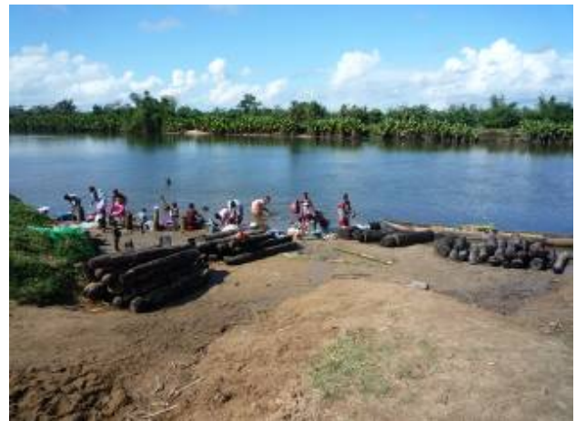
Photo 8: Antjahamarina landing point

The week after the team’s visit to the park, a demonstration was held in Antalaha. This was against the Forestry Administration, which had seized a boat carrying illegal rosewood – a redirection of the labourers’ anger towards the government that demonstrates the influence of the timber barons in local communities and over the people working to fill their stockpiles.