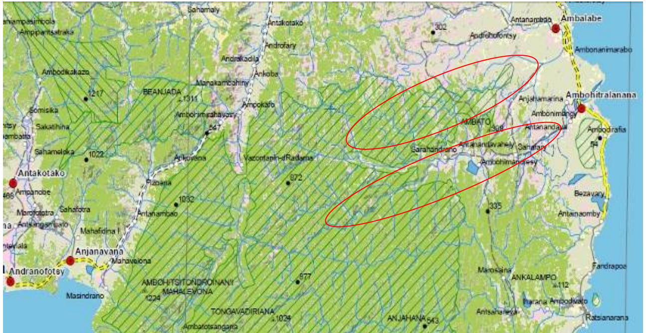
Figure 3: Transport routes from the forest in the Northeast of Masoala NP to the coast areas

if the collectors continued to withhold payment. However, despite their disquiet, a lack of economic opportunities seems to drive a number of young unemployed or underemployed persons to accept meagre partial payments for their work.