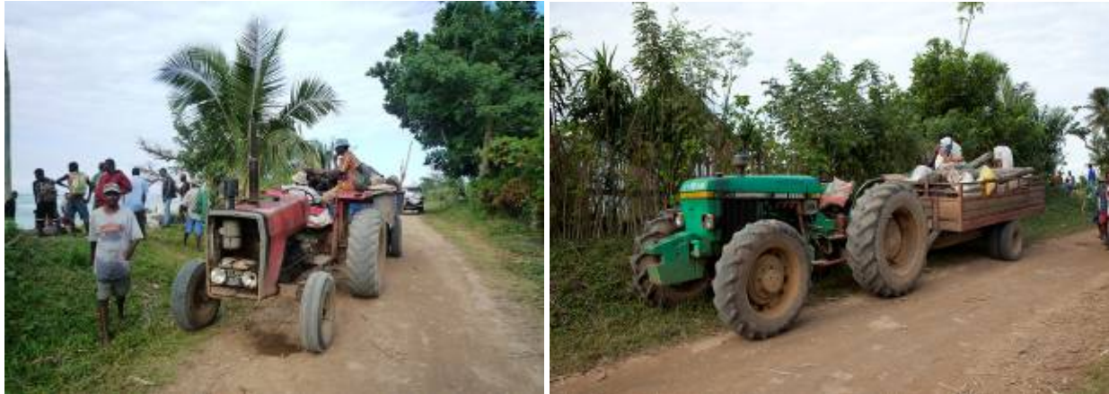
Photos 13, 14: Tractors transporting rosewood to Mahatsara, Antalaha

None of the authorisations to transport wood required by law (Article 40, Decree 98-782) could be produced by the drivers of the observed vehicles.