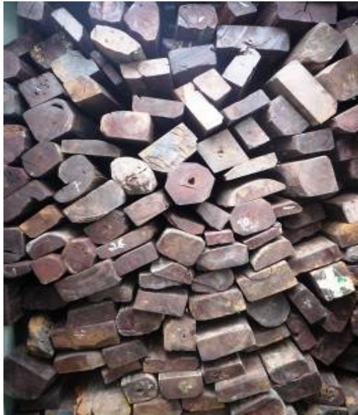
Photo 3: Planks in container at Vohémar