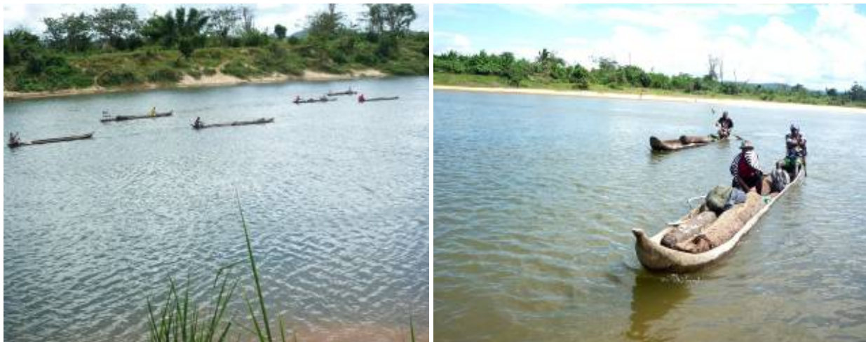
Photos 15, 16: Boats transporting rosewood from Masoala NP to Antjahamarina

The team hired two boats to reach the area of logging activities in the Masoala National Park, in order to observe the transport of rosewood, evidence of which had been found at the locations mentioned above. On the five-hour journey upriver, 42 boats were counted, each carrying an average of five logs of varying sizes.