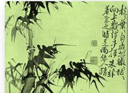
Bamboo 竹子, Xu Wei 徐渭, Ming Dynasty 明代

Bamboos are of major economic importance and cultural significance in Asia where they are used for building, food, textiles, paper pulp and innumerable household items. Bamboo 竹 features in artworks and is of prime importance in Chinese gardens where, together with plum blossom 梅, orchid 兰 and chrysanthemum 菊, it is known as one of the Four Gentlemen 梅兰竹菊 which are considered to represent the four seasons. And, of course, bamboo is the food of the Giant Panda.