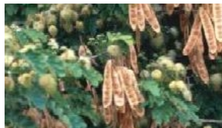
Flowers and pods (Gutteridge R.C.)