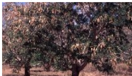
Leaves and fruit at Happy Valley, Maui, Hawaii