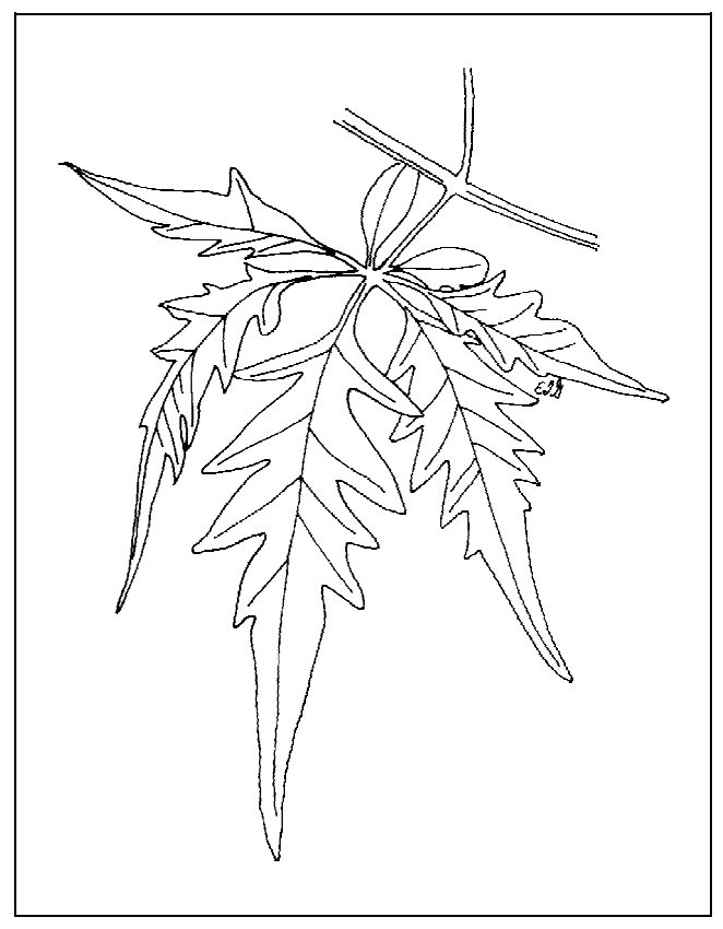
Figure 3. Foliage of Cut-Leaf Chastetree.