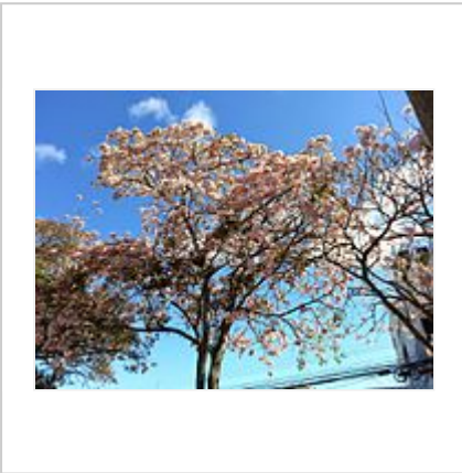
Tree in bloom