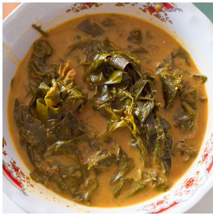
Kaeng khilek , a Thai curry made with Kassod leaves and flower buds

Senna siamea (Thai: ขี้เหล็ก, khilek ), also known as Kassod Tree , Cassod Tree and (incorrectly) as Cassia tree , [1] is a legume in the subfamily Caesalpinioideae. It is native to South and Southeast Asia, although its exact origin is unknown. [2]