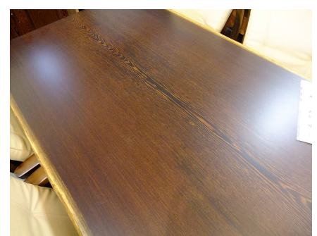
Wood from S. siamea (鉄刀木) is highly valued in Chinese furniture making.