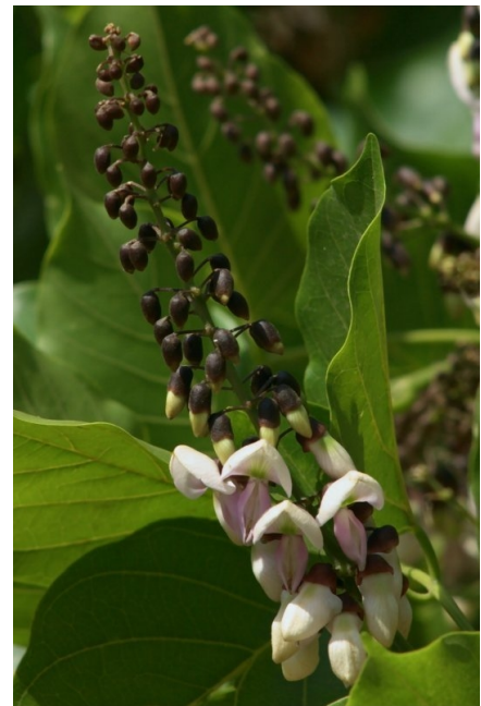
Millettia pinnata is renowned for its shade and is well known in traditional uses for its medicinal properties. It is also grown as a host plant for lac insects. The tree is also one of the food plants for Common Cerulean ( Jamides celeno ). The seeds contain pongam oil that is now being explored as an alternate fuel source.

In 2003 the Himalayan Institute of Yoga Science and Philosophy as part of its Biofuel Rural Development Initiative started a campaign of education and public awareness to rural farmers about M. pinnata in two Indian states. One of the Himalayan Institute's partners developed a consistently high yield scion that reduced the time it takes to mature from 10 years to as little as three. To help the farmers in the transition from traditional crops to M. pinnata the Indian government has contributed over $30 million in low-interest loans and donated 4.5 million kg (5,000 short tons) of rice to sustain impoverished drought-stricken farmers until the trees begin to produce income. Since the project began in 2003 over 20 million trees have been planted and 45,000 farmers are now involved. [2]