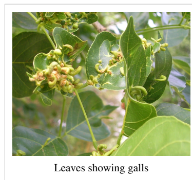
Leaves showing galls