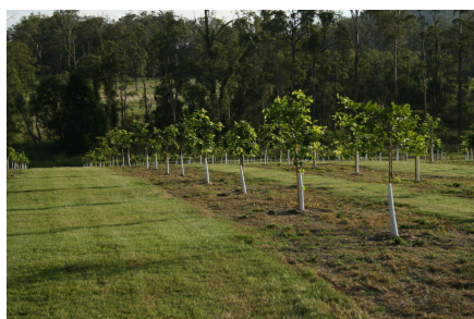
Pacific Renewable Energy trial plantation in Caboolture, Queensland.

In 2006 the Himalayan Institute began looking at locations in Africa to transplant M. pinnata into. Initially they began in Uganda but due to the lack of infrastructure and growing desertification the project has been growing very slowly. They have also begun a project in the Kumbo region of Cameroon where conditions are better. There has been some suggestions that M. pinnata could be grown all the way across the continent as a way to prevent the encroachment of the Sahara.