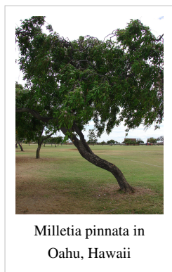
Milletia pinnata in Oahu, Hawaii