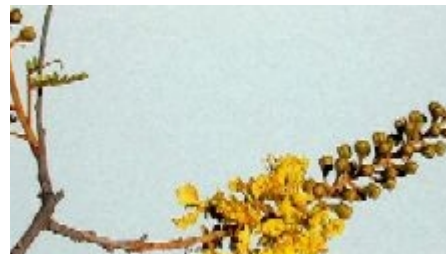
Showy bright yellow flowers of Peltophorum africanum . Occur in dense axillary sprays, up to 150mm long. Petals bright yellow, crinkled, about 20mm in diameter. Flower stalks and backs of sepals covered with brown velvety hairs. (Jooste M)

The flowers are a source of pollen for bees.