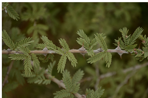
Prosopis cineraria Branch

P. cineraria is a small tree, ranging in height from 3 – 5 m. Leaves are bipinnate, with 7 – 14 leaflets on each of 1 – 3 pinnae. Branches are thorned along the internodes. Flowers are small and creamy-yellow, and followed by seeds in pods. The tree is found in extremely arid conditions, with rainfall as low as 150mm annually; but is indicative of the presence of a deep water table. As with some other Prosopis spp., P. cineraria has demonstrated a tolerance of highly alkaline and saline environments.