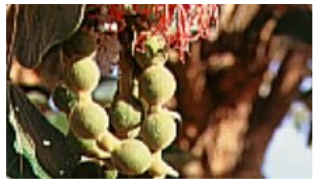
Detail of the unusual "petals" which characterize this species. (Ellis RP)