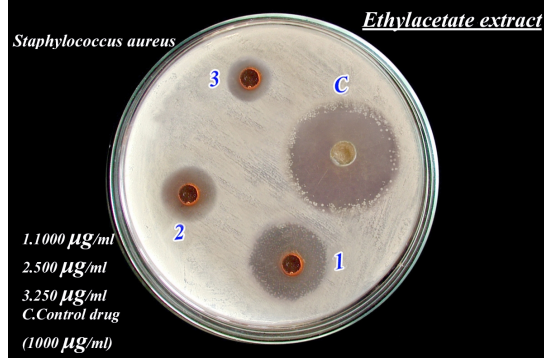
Fig. 1: Ethylacetate extract activity on Staphylococcus aureus