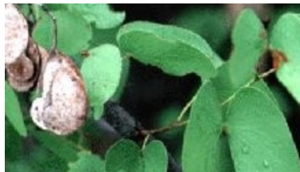
Pestles and mortars made from C. mopane stemwood in Northern Namibia (Martien Gelens)