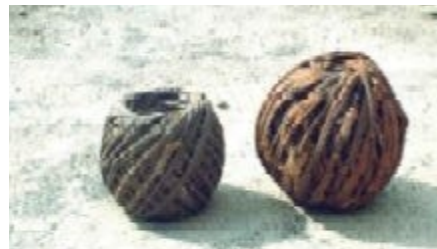
Rope/twine made from C. mopane bark in northern Namibia.