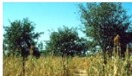
Young Colophospermum mopane trees mixed with agricultural crops in a farm in Northern Namibia (Martien Gelens)

It is often deciduous to an extent, being leafless for up to 5 months, although usually for less. Flowering begins at 5 years of age. The sticky seeds cling to the hooves of passing animals and are dispersed. They are also wind dispersed.