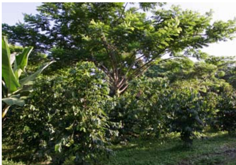
Young rain tree planted for shade in a coffee orchard, Holualoa, Hawai'i.

Two sources report that the crafts made of rain tree wood that are sold in Hawai'i to tourists are now largely imported from the Philippines and Indonesia. There is an indication that there is not enough local production of wood in Hawai'i to meet the demand for tourist curios.