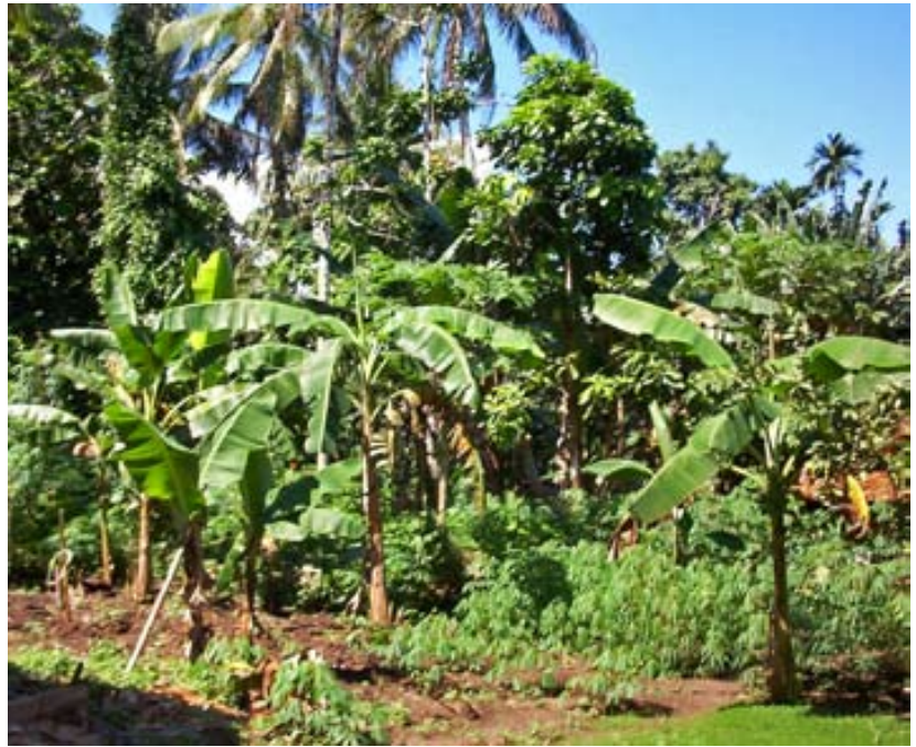
Typical homegarden with cutnut in the background, and banana, cassava, etc. in the foreground. Poroporo, Choiseul, Solomon Islands.

Cutnut is part of the traditional agroforestry practiced by native people in the Melanesian countries of the Solomon Islands, Vanuatu, and Papua New Guinea. The species has been planted or protected along boundaries, in secondary forests, and within the surroundings of human settlements. Like canarium nut ( Canarium spp.), it traditionally indicated occupation and ownership of tribal lands. Almost every part of the plant has been traditionally useful. Leaves and bark are largely used for medicinal purposes, while fallen branches are used for firewood. Despite its poor quality, the wood is used by some for crafts and temporary light construction. Fruits are harvested either at maturity or collected as they fall to the ground when ripe. The kernel inside the fruit is edible, tasty, and highly nutritious and is eaten as a snack or prepared into dishes for a main meal. Kernels are sold in both domestic and export markets to generate income. Furthermore, the species is interplanted with other tree species and agriculture crops to maximize farm output. In this respect, cutnut provides good environmental services such as soil amelioration, shade, and shelter. It is a good middle-story companion tree species that provides easy access to the top of clear-bole species such