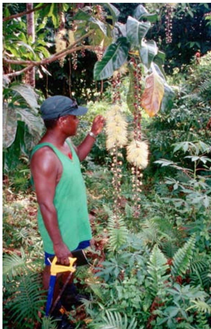
Left: Seedling root system. Right: The author examines flowers B. novae-hiberniae at Vovohe, Kolombangara Island.