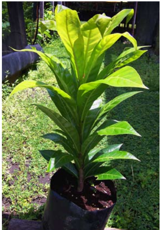
Six-month-old clone at Ringgi nursery (KFPL), Kolombangara, Solomon Islands.

Lack of appropriate postharvest extraction, drying, and storage of kernels at village level may be a production constraint. Centralized extraction units may be impractical