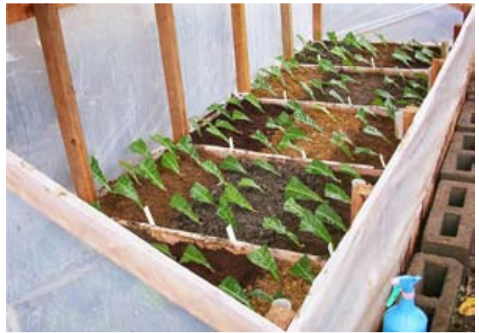
Left: Stockplants of selected trees in multiplication garden. Right: Poly-propagator system. All photos taken at Ringgi nursery, Kolombangara, Solomon Islands.