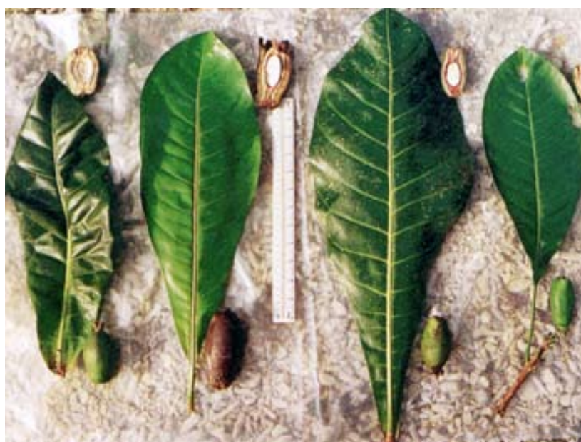
Left to right: Leaves and fruits of Barringtonia procera (dwarf tree), B. edulis , B. procera , and B. novae-hiberniae .

Species of cultural importance include B. asiatica and B. racemosa . In the Solomon Islands, B. asiatica is used for fish poisoning and treating toothache, while B. racemosa is