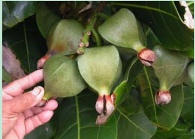
Flowers and fruits of B. asiatica .