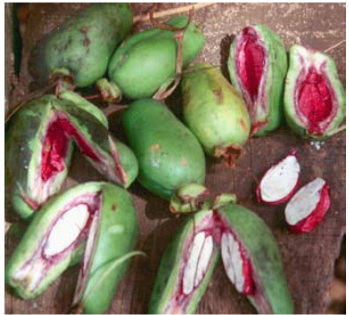
Left and top right: Fruits and kernels. Bottom right: Cutnut variation, green fruit with purplish color of testa and shell. This type is called Kobakilo in Varisi dialect, Choiseul Province, the Solomon Islands. All three photos were taken at Hunda, Kolombangara, the Solomon Islands.

is variable, from grayish green to purplish red. In Vanuatu, fruiting occurs once a year in the wet season (September to March).