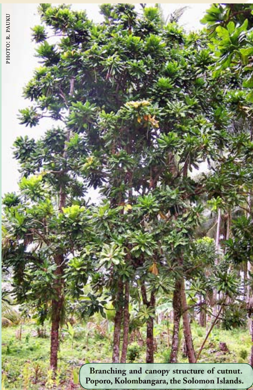
Branching and canopy structure of cutnut. Poporo, Kolombangara, the Solomon Islands.