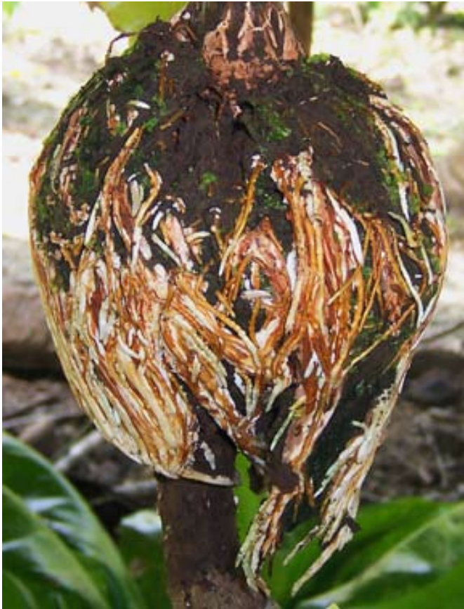
Top: Air-layer on branch in tree. Bottom: Four-week-old air-layer removed from tree. Hunda, Kolombangara, Solomon Islands.

foxes feed on the fruits, and parrots feed on the flowers. Potentially, these animal pests could be drawn to cutnut and thereby introduced to other tree and field crops within the same area.