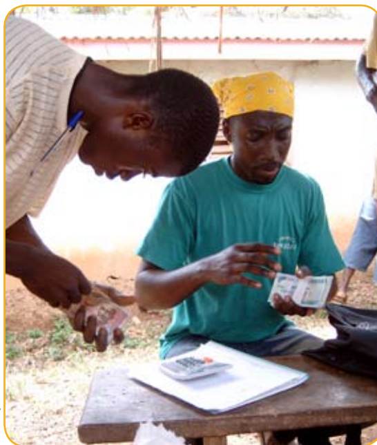
▲ There are no problems with late payment. Allanblackia harvesters in Ghana get cash on delivery.

“There simply weren’t a million trees available with fruit to harvest,” explains Rutatina. Half of those identified in the inventory were probably male; and of those which were female not all would have been good fruiting trees. The Novella Project also failed to take into account the issue of density. “The greater the distance between trees, the less incentive there’d be for harvesters to collect their fruit,” explains Hendrickx. Many of the trees that appeared in the inventories were therefore of no commercial interest.