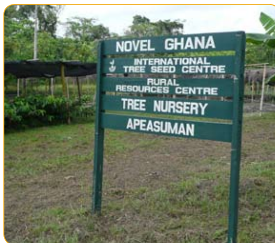
▲ By 2009, over 100,000 superior Allanblackia trees, most raised in nurseries like this one, had been delivered to farmers by the Novella Project.

In 2008, the European Food Safety Authority concluded that Allanblackia seed oil was safe for human consumption, and by the end of 2009, Tanzania alone had shipped 10 containers of