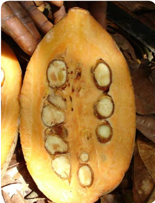
◀ The heart of the matter – Allanblackia seeds embedded in yellow pulp.

Allanblackia . Among other things, the guidelines suggest that organisations and individuals involved in harvesting should encourage the regeneration of Allanblackia , refrain from felling Allanblackia trees and respect existing wildlife legislation. When it comes to domestication, the Novella Project believes that every effort should be made to resist the establishment of large-scale monocultures.