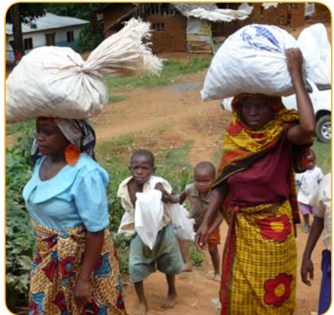
▲ Delivering seeds to a collection centre in Tanzania. The market for Allanblackia seeds has helped women like these to increase their incomes.