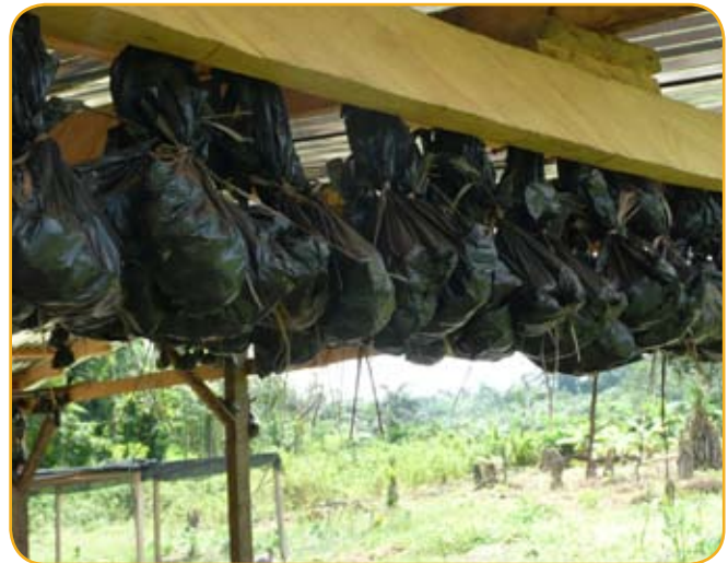
▲ Storing seeds in black plastic bags encourages quicker germination.

These two methods of encouraging germination – seed-coat removal and storage in black bags – were now adopted at FORIG with good results, and in many Allanblackia nurseries you will see black bags of seeds hung from branches and roof joists like rows of hibernating bats. The project is now getting seeds to germinate from four weeks onwards.