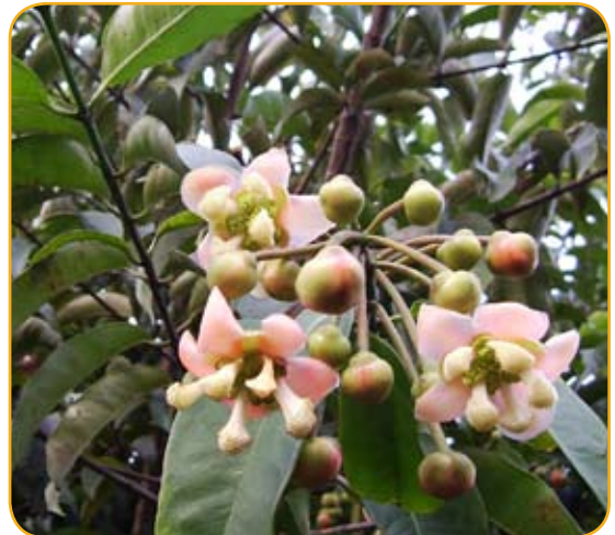
▲ A male Allanblackia tree in flower.

An individual tree can produce up to 300 fruits a year, with the average bearing 100–150 in a good season,