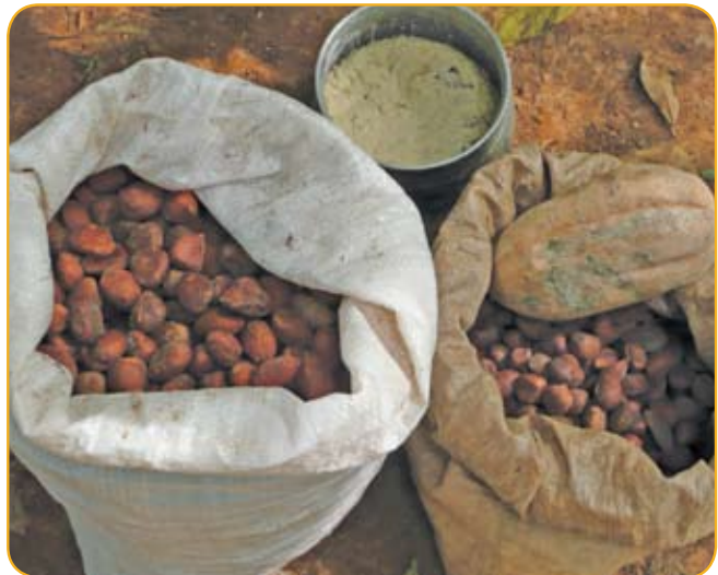
▲ Sacks of Allanblackia seeds, a whole fruit and a pot of Allanblackia cooking fat in a village in Ghana.

The Novella partners also hope that some 10,000 hectares of degraded land will benefit from reforestation schemes using Allanblackia and other species. Besides encouraging biodiversity conservation in areas where Allanblackia is grown, the Novella Project has the goal of doubling farm income for those involved in Allanblackia cultivation by 2017. Eventually, the project partners believe that several million farmers in Africa could benefit from the trade.