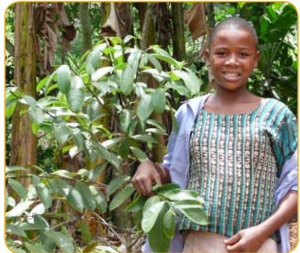
▲ Many farming families in Tanzania are now planting superior varieties of Allanblackia on their land.

The oil consists almost entirely of stearic and oleic acids and it has a very sharp melting point, around