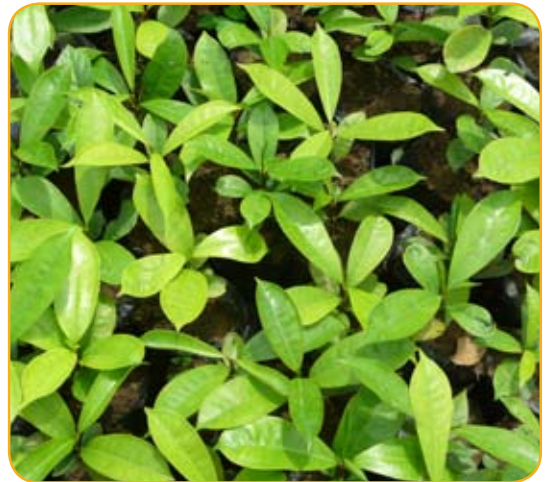
▲ Years of research have gone into establishing the best means of propagating Allanblackia. These seedlings will be used as rootstock for grafting.

After the World Agroforestry Centre joined the project, research in Ghana and Tanzania initially focused on working out how to get Allanblackia seeds to germinate swiftly. Some experiments were outright failures. For example, when growth hormones were applied to break seed dormancy, a commonly used practice, the entire batch of 80,000 seeds died. However, a process of trial and error, assisted by the knowledge of local farmers, eventually began to bear fruit.