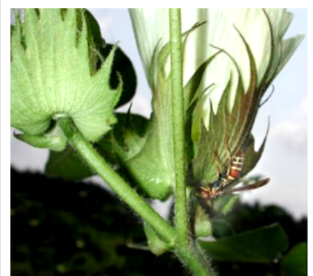
Predatory Polistes wasp looking for bollworms or other caterpillars on a cotton plant