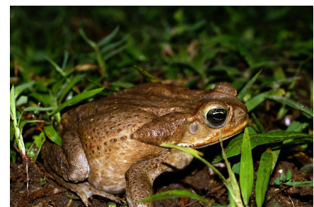
The cane toad, Bufo marinus

Over the past 15 years with the rise in biological control interest there has become a greater focus on the non-target impacts that could occur. [2] In the past many biological control releases were not thoroughly examined and agents of biological control were released without any consideration. When introducing a biological control agent to a new area, a primary concern is its host-specificity. Generalist feeders (control agents that are not restricted to preying on a single species or a small range of species) often make poor biological control agents, and may become invasive species themselves. For this reason potential biological control agents should be subject to extensive testing and quarantine before release into any new environment. If a species is introduced and attacks a native species, the biodiversity in that area can change dramatically. When one native species is removed from an area, it may have filled an essential ecological niche. When this niche is absent it may directly affect the entire ecosystem.