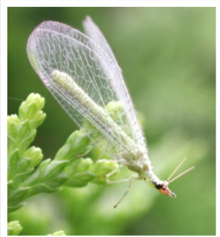
Lacewings are available from biocontrol dealers.

The larvae of many hoverfly species principally feed upon greenfly, one larva devouring up to fifty a day, or 1000 in its lifetime. They also eat fruit tree spider mites and small caterpillars. Adults feed on nectar and pollen, which they require for egg production.