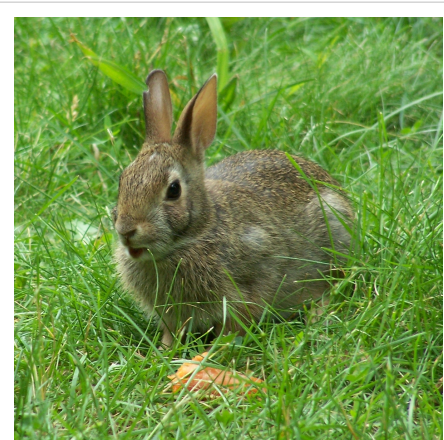
The European Rabbit ( Oryctolagus cuniculus ) is seen as a major pest in Australia and New Zealand.

In cases of massive and severe infection of invasive pests, techniques of pest control are often used in combination. An example being, that of the emerald ash borer ( Agrilus planipennis Fairmaire, family Buprestidae), an invasive beetle from China, which has destroyed tens of millions of ash trees in its introduced range in North America. As part of the campaign against the emerald ash borer (EAB), American scientists in conjunction with the Chinese Academy of Forestry