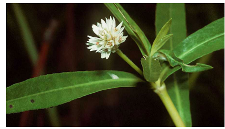
The invasive species Alternanthera philoxeroides (alligator weed) was controlled in Florida (U.S.) by the introduction of Agasicles hygrophila (alligator weed flea beetle)