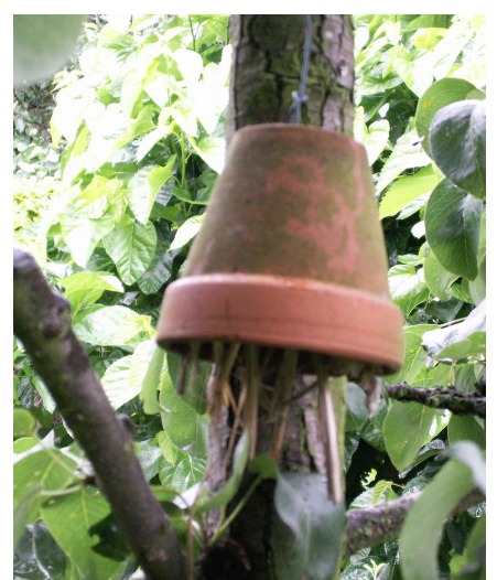
A turnaround flowerpot, filled with straw to attract Dermaptera -species

Naturally occurring biological controls are often susceptible to the same pesticides used to target their pest hosts.