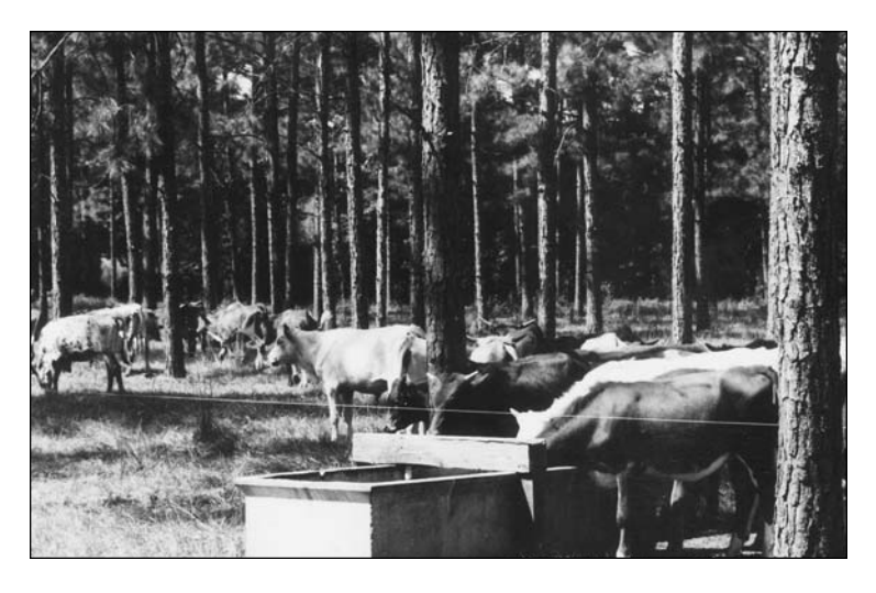
Properly located water sources, even shade distribution, and well-proportioned grazing paddocks improve grazing and water intake efficiency.