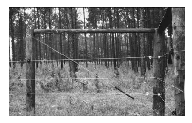
Energized high tensile wire fence will withstand falling debris. Strategically locate power switches to improve pasture access and diagnosing power failures.