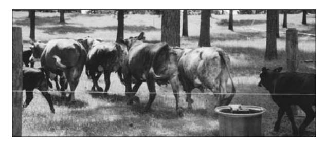
High tensile wire fence and portable water tanks are economical tools for improving silvopasture utilization.

Silvopasture is an agroforestry system that combines grazing livestock with growing trees for a timber product. Creating small, fenced paddocks and rotating cattle builds in "recovery periods" for the forage and protects the soil and trees. In a silvopastoral system, grazing recovery periods can only be achieved when well-designed livestock water supplies and cross fences are used.