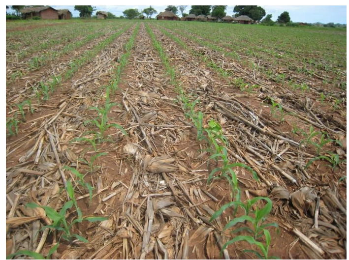
Figure 3: Maize field under "old ridge" tillage or flat tillage in Nkhota kota under MACC project of TLC in 2009