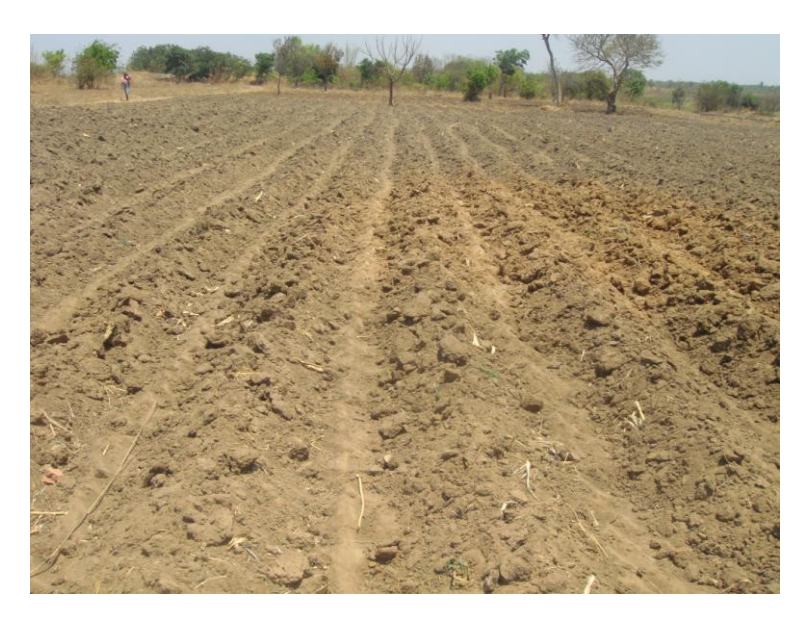
Figure 1: Crop field tilled with hand hoe by a smallholder farmer