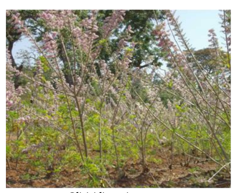
Figure 8: Flowering Gliricidia sepium trees during during season

Gliricidia is a fast-growing, nitrogen-fixing leguminous tree that is used in agroforestry to add nitrogen and organic matter to the soil. The nitrogen fixing ability and nitrogen-rich leaves of Gliricidia sepium make it an ideal intercropping plant in the nitrogen deficient soils in Malawi.