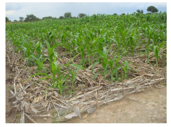
Figure 5: Maize planted in the permanent planting basins