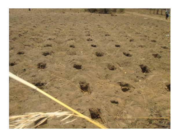
Figure 4: Land preparation for permanent planting basins

Adapted from a guide to Conservation Agriculture in Zimbabwe (2009) and Sasakawa Global 2000