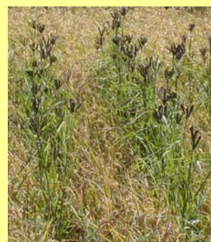
Rice with Eleusine

For this study, upland rice and maize were cropped (in double lines for rice) in association with Eleusine coracana (E), Cajanus cajan (C), Raphanus sativus (R, 2 dates), Vicia villosa (V) Crotalaria grahamiana (Crg), Crotalaria spectabilis (Crs), Lupinus sp. (L, 2 dates), Stylosanthes guianensis (S), Brachiaria ruziziensis (B) and with the mixtures of forage crops. These systems are compared for the competition and complementarities between crops in terms of grain yield of rice and maize, and biomass production, during 2 seasons 2007 and 2008.