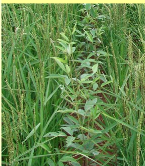
Rice with Cajanus

For this study, upland rice and maize were cropped (in double lines for rice) in association with Eleusine coracana (E), Cajanus cajan (C), Raphanus sativus (R, 2 dates), Vicia villosa (V) Crotalaria grahamiana (Crg), Crotalaria spectabilis (Crs), Lupinus sp. (L, 2 dates), Stylosanthes guianensis (S), Brachiaria ruziziensis (B) and with the mixtures of forage crops. These systems are compared for the competition and complementarities between crops in terms of grain yield of rice and maize, and biomass production, during 2 seasons 2007 and 2008.